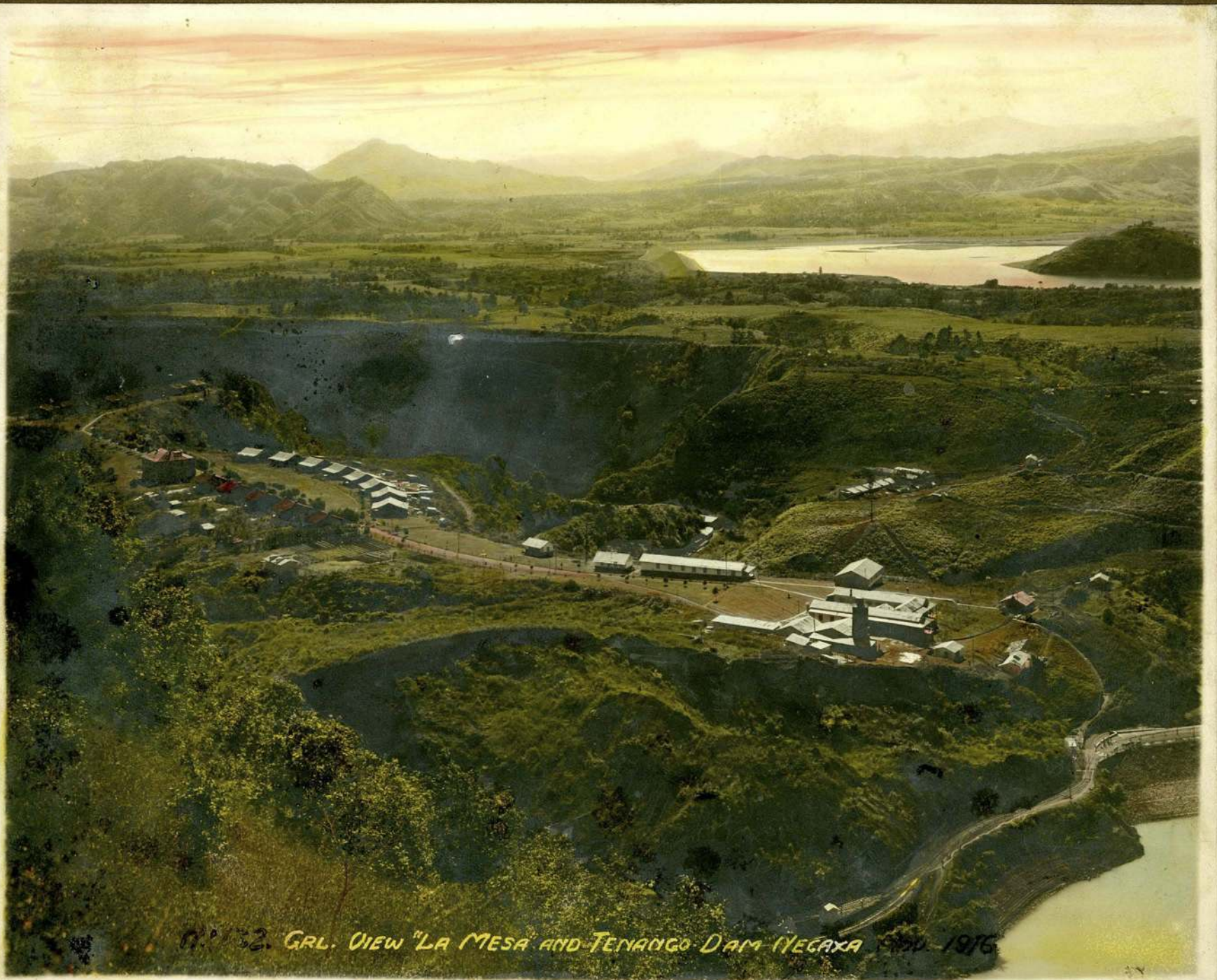
01132. GRL. VIEW "LA MESA" AND TENANGO DAM NECAXA 1910-1916