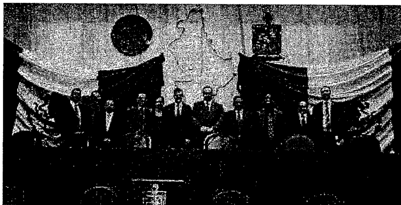
The Pol/Econ section and political-coned ELOs visit Nuevo Leon's state congress.